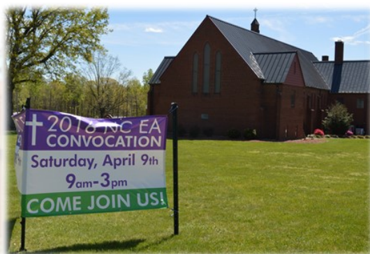
Paul's Chapel—Site of NC Regional