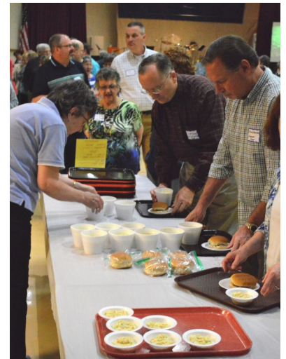
Volunteers from Salem Reformed in Hagerstown provide lunch