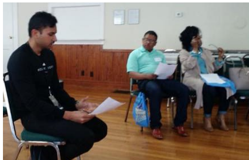
Workshop at the NC Regional