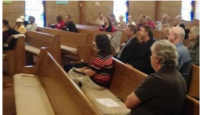
Worship time at the NC Regional