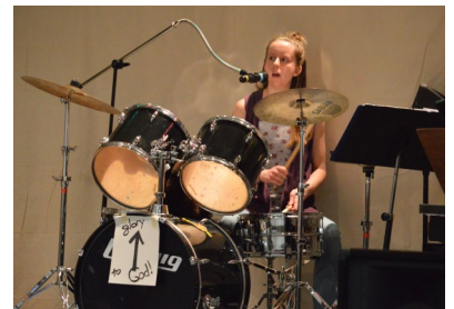
Praising God at the Mid-Atlantic Regional