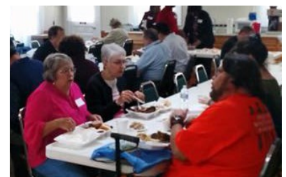
Enjoying fellowship at Mt Hope Church in Salisbury, NC