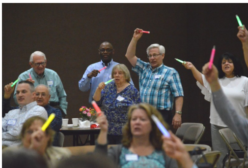
Letting the light - glow sticks - shine at the Mid Atlantic Regional