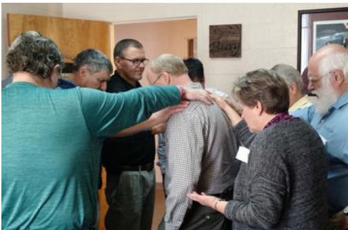
Praying at the North Carolina Regional