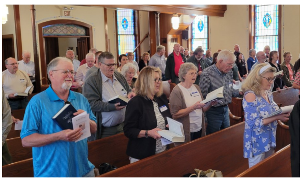
Praising the Lord during opening worship at the Gateway Regional.