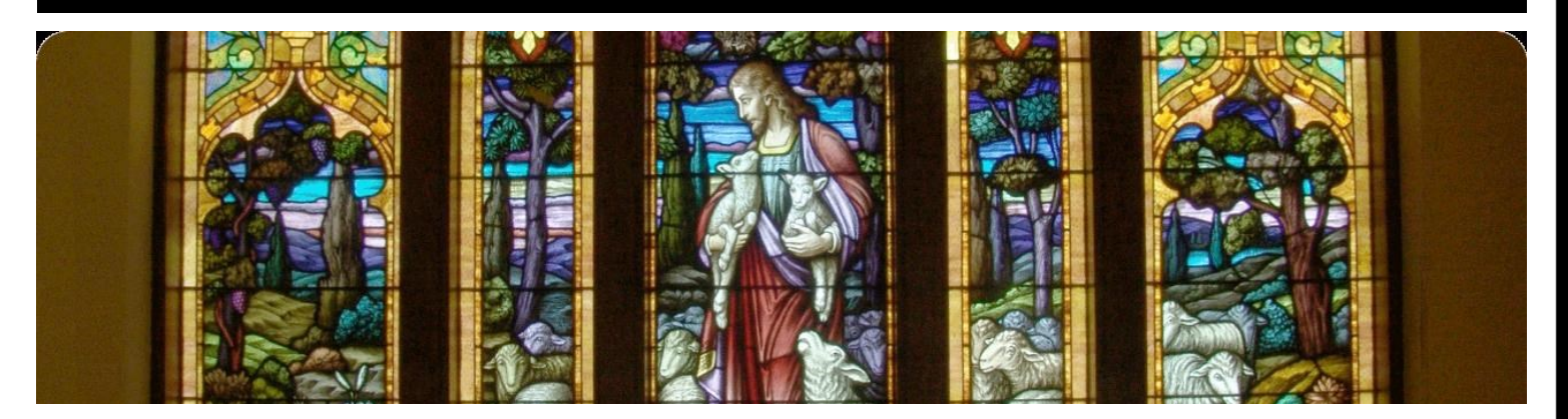
"Blessed are the peacemakers, for they shall be called sons of God." Matthew 5:9