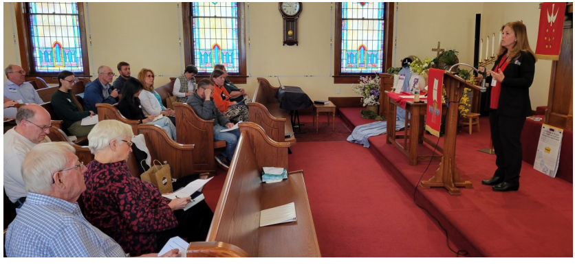
Helping Kids Fall Deeply In Love with Jesus was the topic of this Gateway Regional workshop.