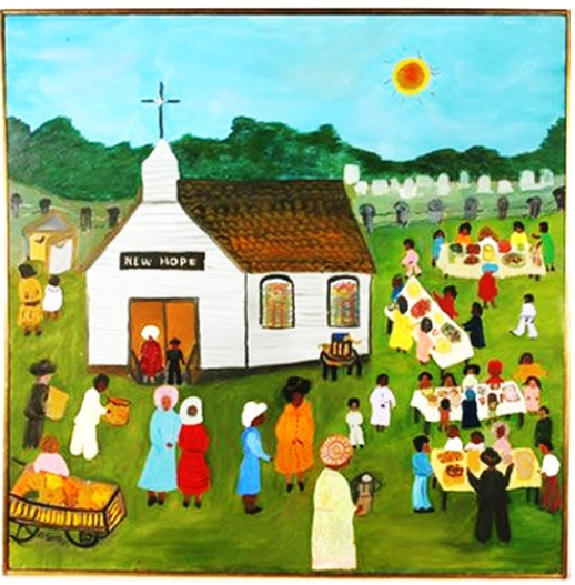
continued on page 6

Retired pastor Bill Miller reports that proceeds of the sale go to missions and repairs on the church building.