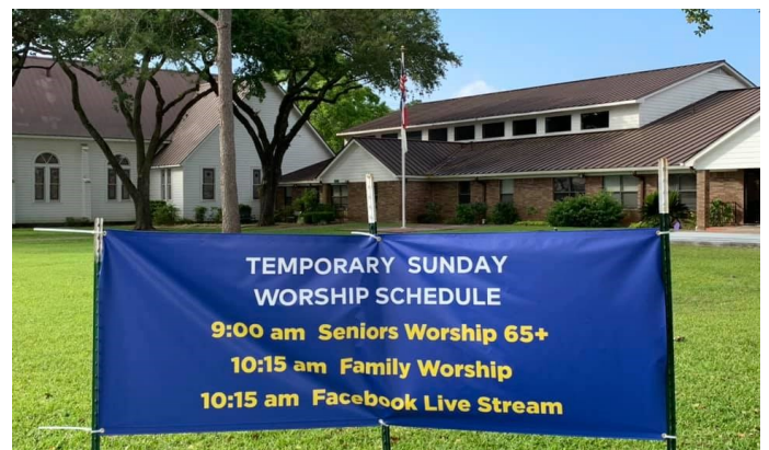
Immanuel Evangelical Church in Needville, Texas reopens with an additional worship service for seniors