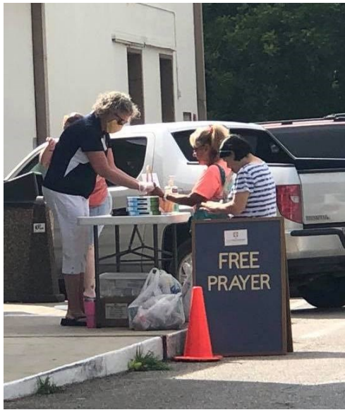
First Protestant Church volunteers offer free prayer outside a local market