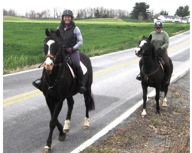
Arriving for drive in worship at Salem Church in Waynesboro, Pennsylvania