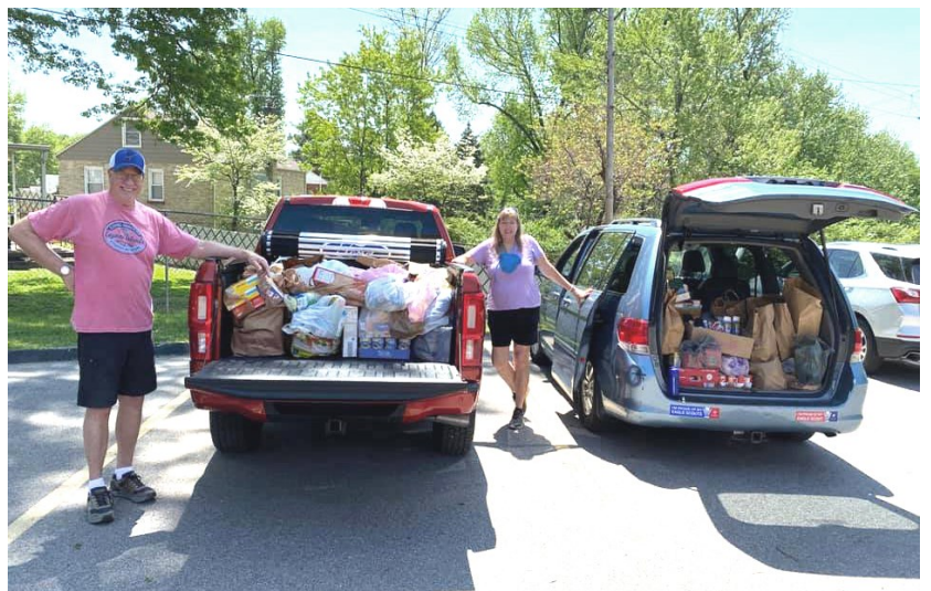
Bethesda Church in St. Louis conducts drive up food collection for local pantry

In the uncertain economic environment our country is currently facing, many congregations in the Evangelical Association are continuing or beginning outreach and service ministries designed to help those who are suffering. At Bethesda Evangelical Church in St. Louis, Missouri the congregation organized a “drive up” food donation event to help restock a local community food pantry while the members of Beaver’s Chapel Christian Church in Zebulon, North Carolina continue to offer a limited food pantry out of their own church facility. Meanwhile, at First Protestant Church in Texas, members of the church received permission to set up a “free prayer” table to offer spiritual assistance outside a local market, complete with hand sanitizer and face masks.