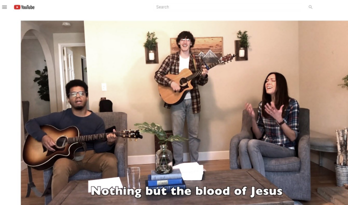
Worship team at Church of the Valley in Santa Clara, California goes online with lyrics for congregational singing