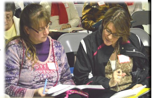
Studying Scripture at the Mid-Atlantic Regional

On Saturday, March 25 the Mid-Atlantic regional was held at Host Church in Bernville, Pennsylvania. The theme of the gathering was “Overcoming Obstacles” and included worship and workshops on a variety of topics including the spiritual care of dementia patients, the spiritual disciplines of prayer and fasting and how to plan a personal spiritual retreat.