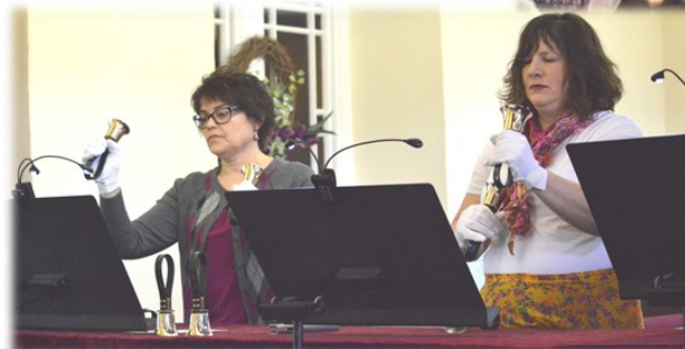
Members of The Host Church Bell Choir lead worship at the Mid-Atlantic Regional