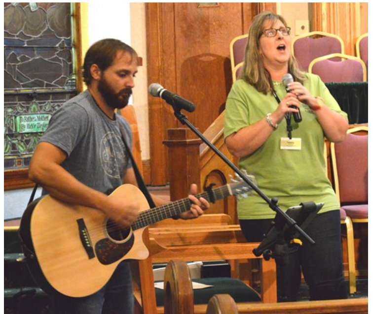
Praising the Lord during Convocation worship