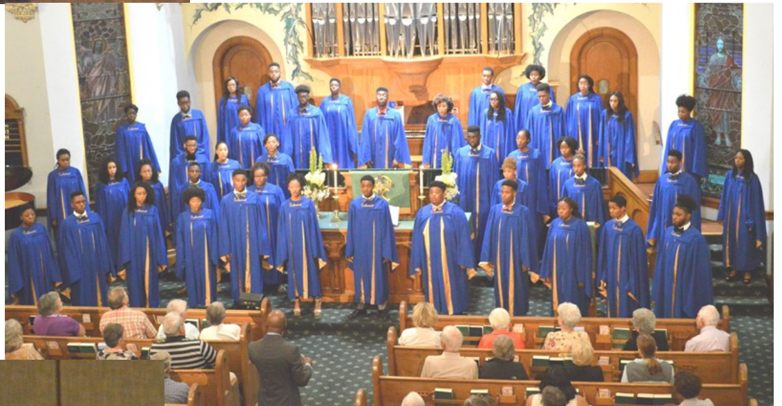
The Aeolians of Oakwood University, perform a concert of classic Christian music on Saturday evening