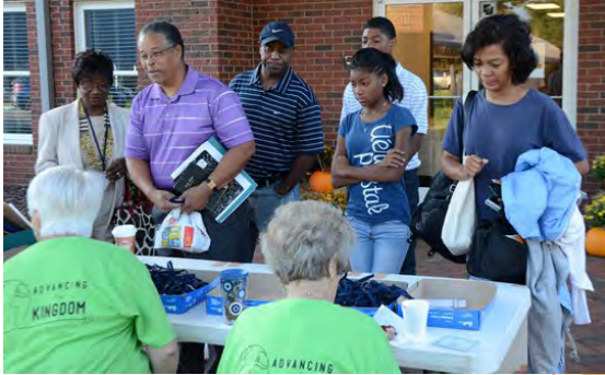
Checking in at registration