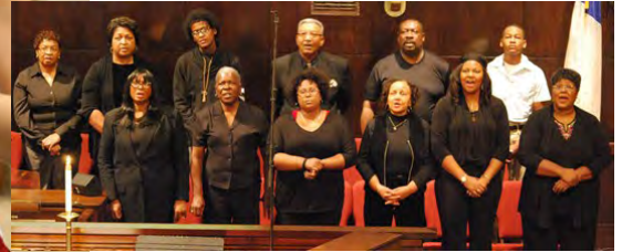
Green Level Church choir sings praise