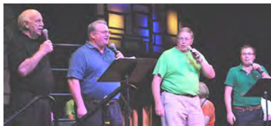
Gospel Quartet from First Reformed Church

The rest of the morning and afternoon was spent attending as many of twenty workshops that we could. I attended a choir workshop and also a workshop on reaching different generations through worship music. Others in our group attended workshops on ministry to Muslims and