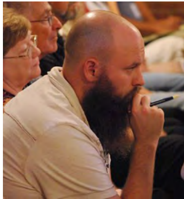
Reflecting on the words of Dr. Gary Chapman

Saturday morning we were eager to hear Gary Chapman who is a well known author who grew up in Landis. He has written numerous books on the