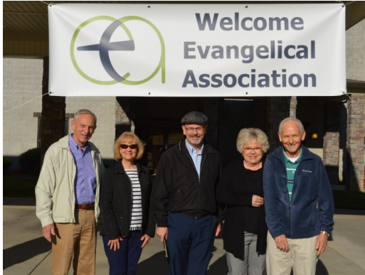
Members of St. John's Reformed in Kannapolis arrive for the regional gathering.