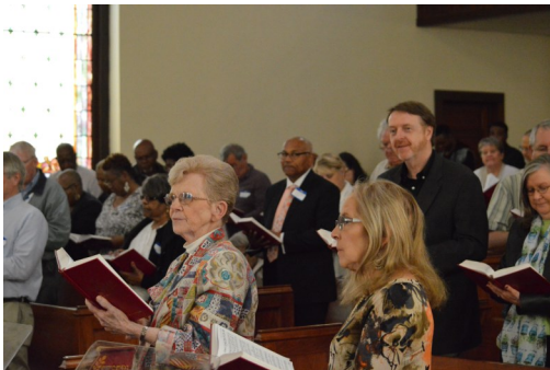
Praising the Lord in song at Shiloh Reformed Church