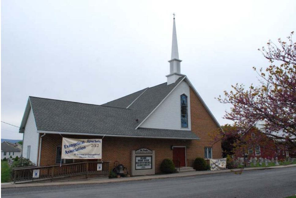
St Paul's Reformed, Beavertown, PA