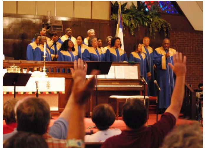
Praise & Worship at North Carolina Regional