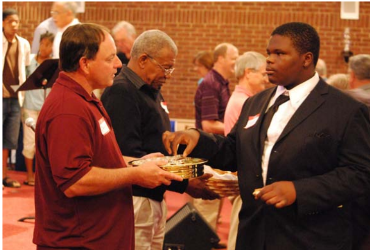
Celebrating the Lords Supper at North Carolina Regional

In gatherings at St. Paul's Reformed Church in Beavertown, Pennsylvania on April 28 and First Reformed enjoy worship and fellowship and a time of exalting the name of Jesus with fellow believers from across their the host pastor of the North Carolina gathering. Choirs sang, puppets spoke, pastors preached and the people