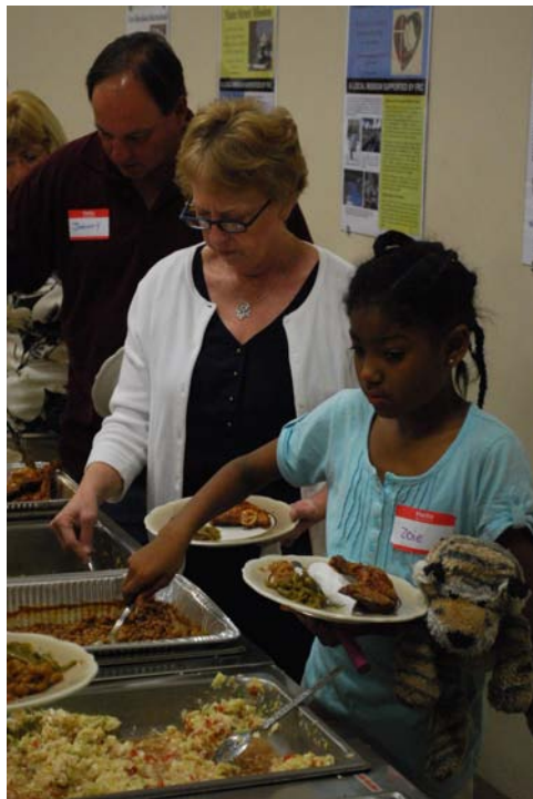
Dishing up the BBQ at the North Carolina Regional