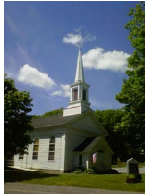
First Congregational Church Torrington, CT