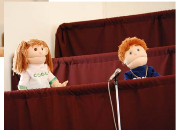
MidAtlantic Regional 2012 (picture to the left)