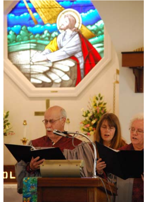
Choir at St Paul's Reformed Beavertown, PA