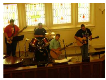
Cross Community Praise Band leads worship.

During lunch, attendees at the Regional Gathering heard from four mission speakers who had displays showcased at the event.