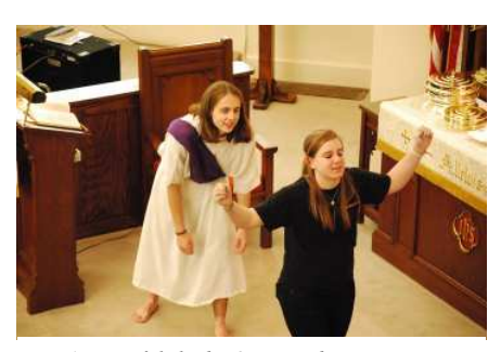
A powerful skit by OnceDeadTwiceBorn. Bethel-St. Paul Church, Louisville, KY