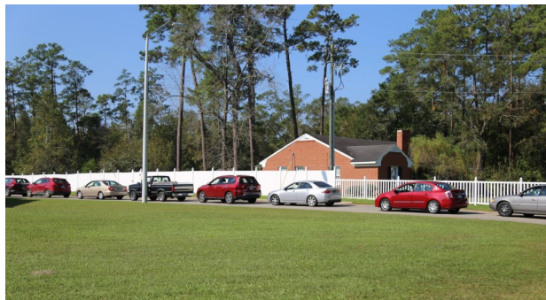
Hurricane victims line up for help from Project 10,000