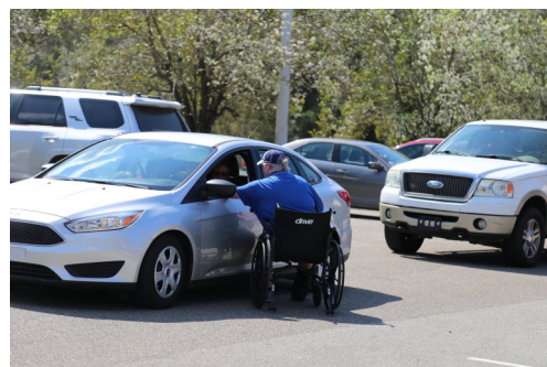
Praying and encouraging people as they wait for relief supplies