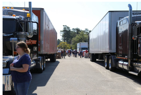
Two semis and a utility truck filled with goods ready to be distributed.