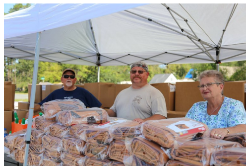
Volunteers distributing tarps.