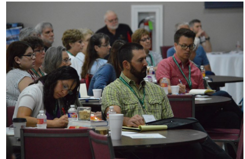
Convocation participants listening to a keynote speaker