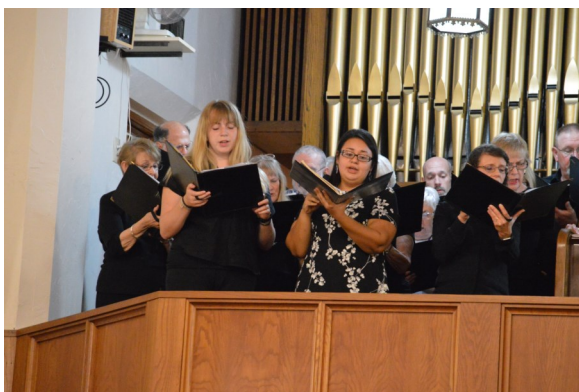
Members of the combined choir sing during Saturday night worship