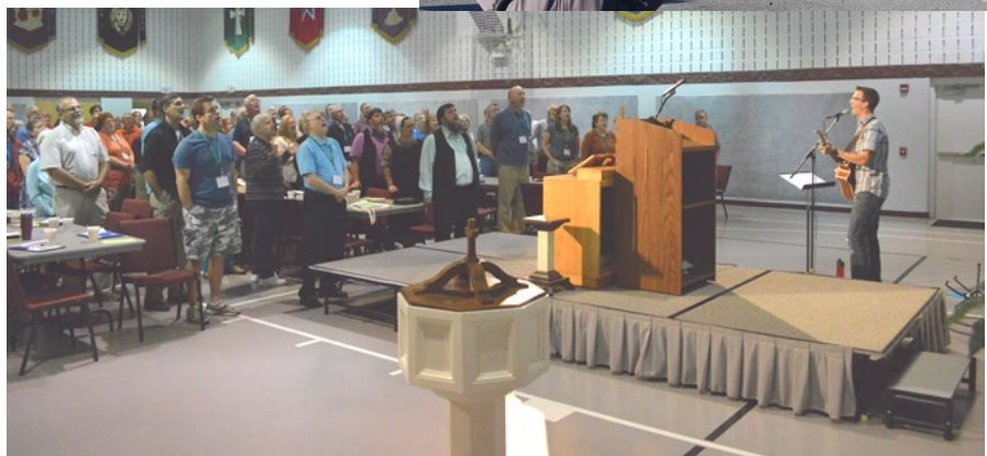
Gathered for worship in the multipurpose room at Swamp Church