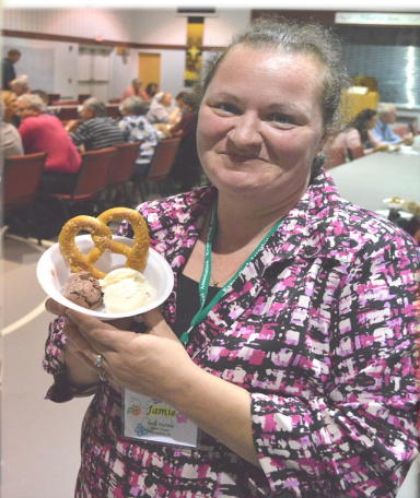
Pennsylvania pretzels and ice cream were on the snack menu for Convocation 2015