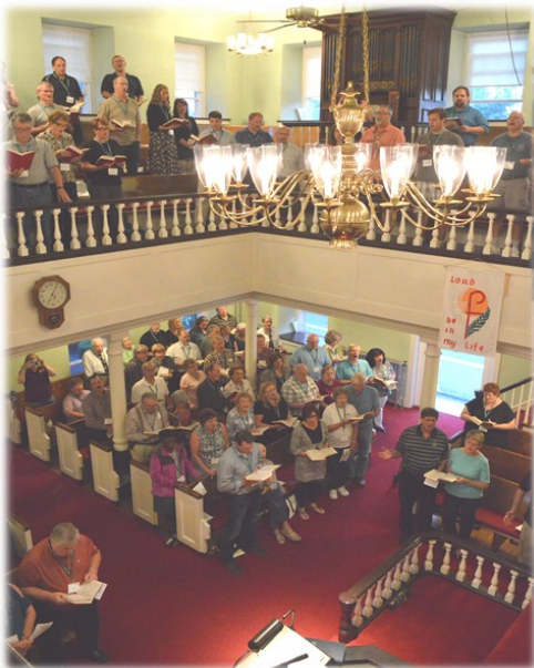
Praising the Lord in the historic Swamp Church sanctuary on Friday night