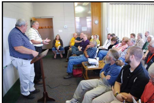
Church Planting Workshop

The journey home was as much fun as the journey to the convocation with stops to shop and just enjoy time with each other. My wish is that we could charter a bus next year and take the whole church to Landis, North Carolina for the next EA convocation!