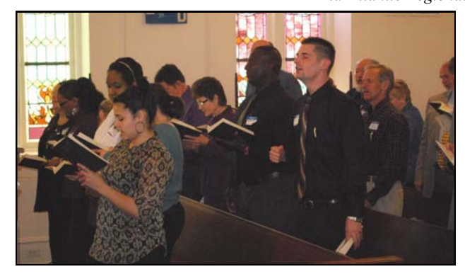
Praising the Lord at the Mid-Atlantic Regional.

Tell us what is happening in your ministry!!! E-mail articles to ~ natmin@evangelicalassociation.org