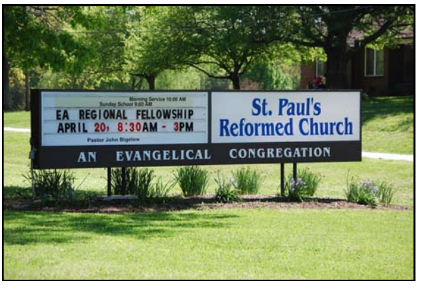
North Carolina Regional Fellowship.