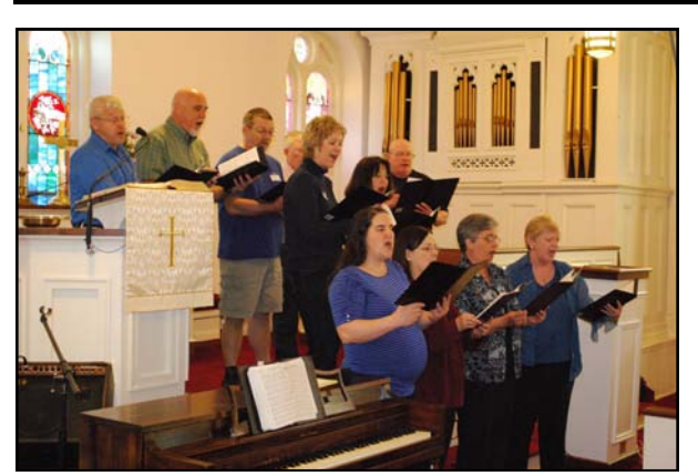
Salem Evangelical & Reformed Church Choir Reamstown, PA