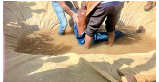
Baptism in hand-dug pit, water carried 7 miles.

Pray for this missionary family that they will be strengthened by God to carry out His plans as they move out into more unreached areas.