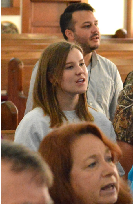
Praising the Lord during convocation worship.