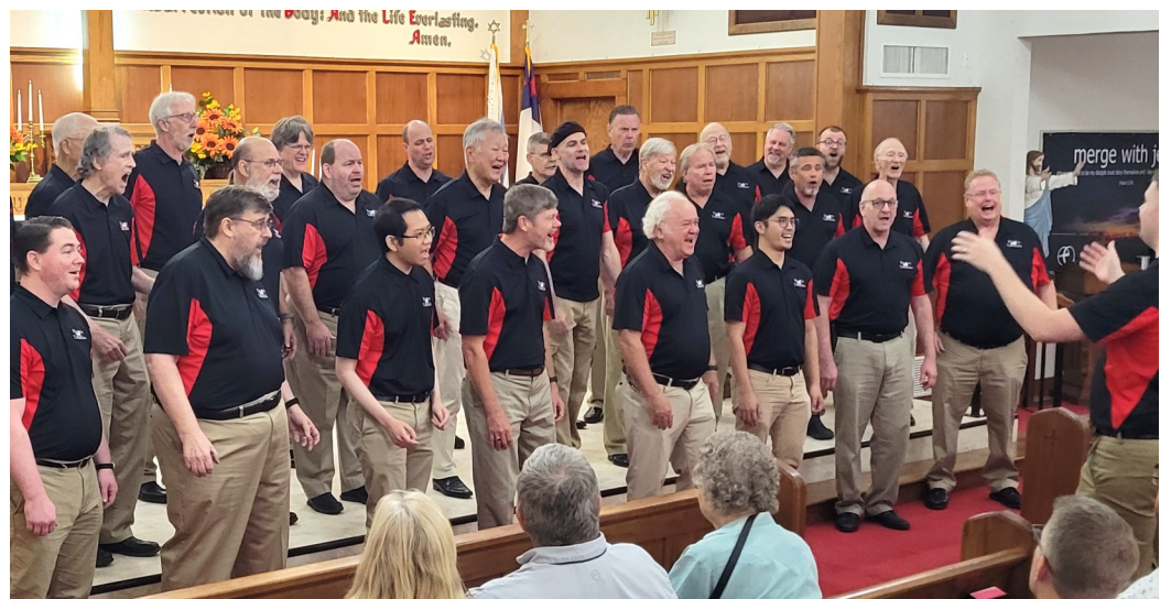
Houston Tidelanders acapella chorus sings Friday night.